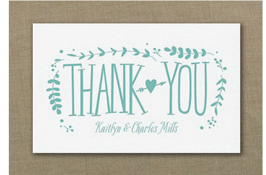
THANK YOU CARDS

WE'LL ANSWER ANY QUESTIONS YOU HAVE. CALL US TODAY AT 888.268.7420